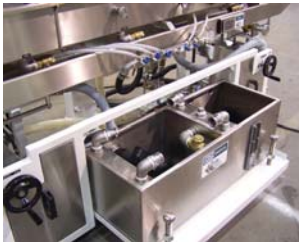
Retractable Water Reservoirs for Easy Cleaning Access